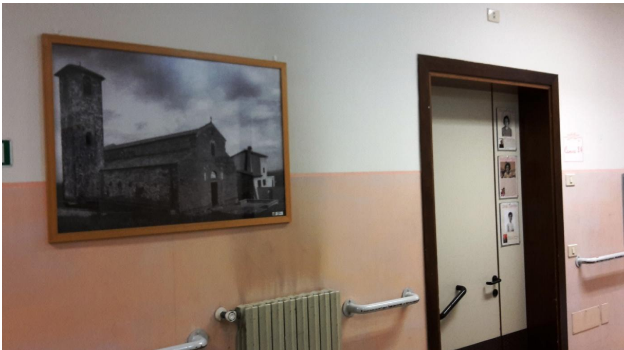
Picture 3: a historical picture of Figline Valdarno (on the left) and the door of one of the sleeping rooms with pictures of the respective elderly (on the right)